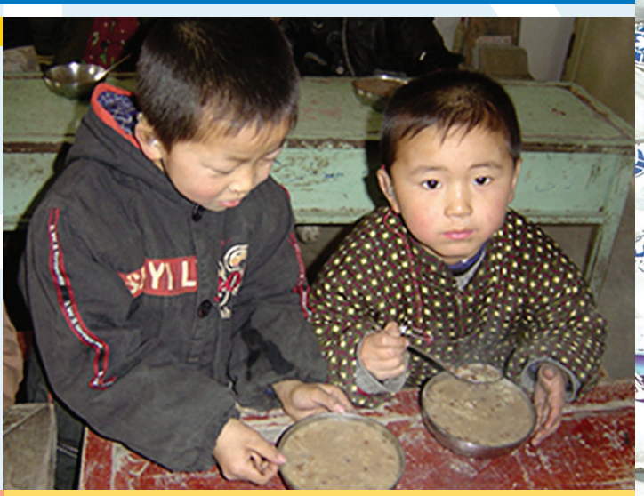
WCF helps provide the nutritious food source "Vitameal" to these orphan children in China.