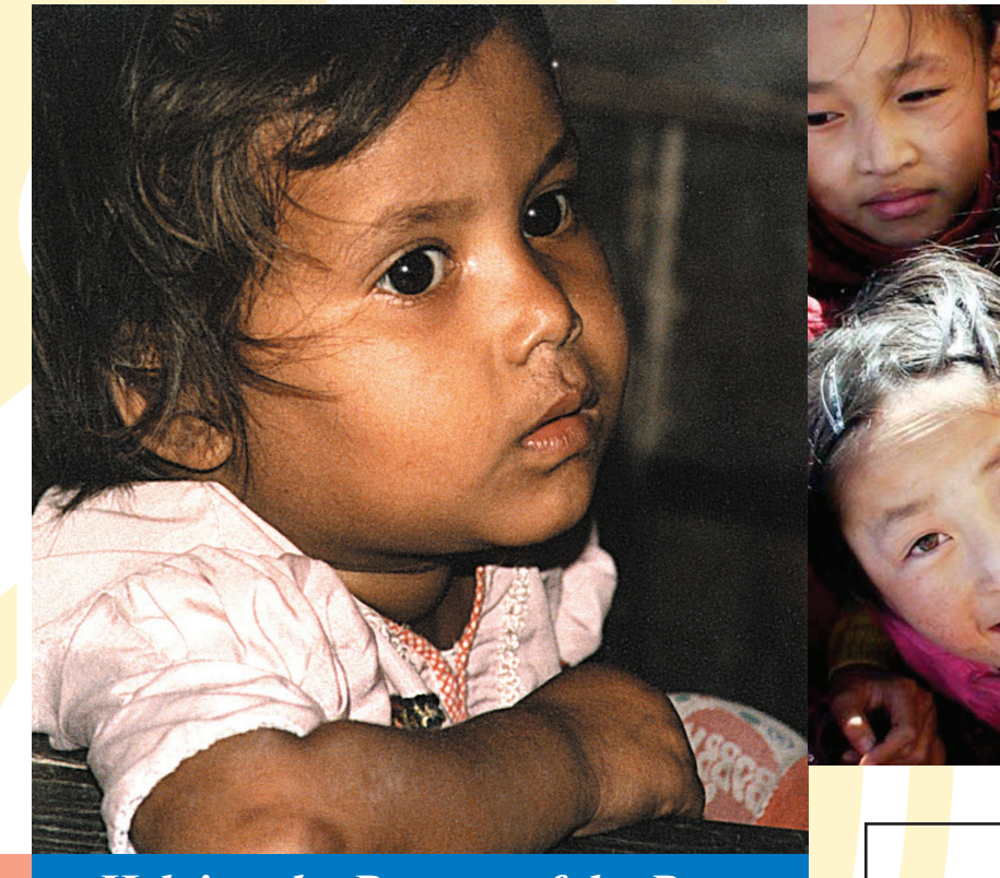
Helping the Poorest of the Poor