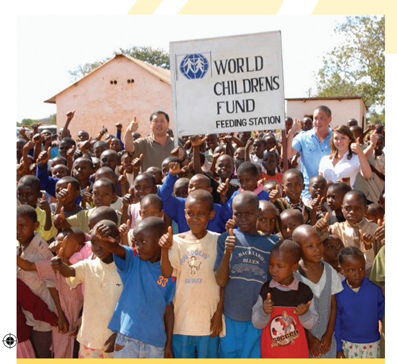
WCF's feeding stations in Africa provide hope for thousands of needy African children.

Our "SPECIAL APPRECIATION " To our contributors!